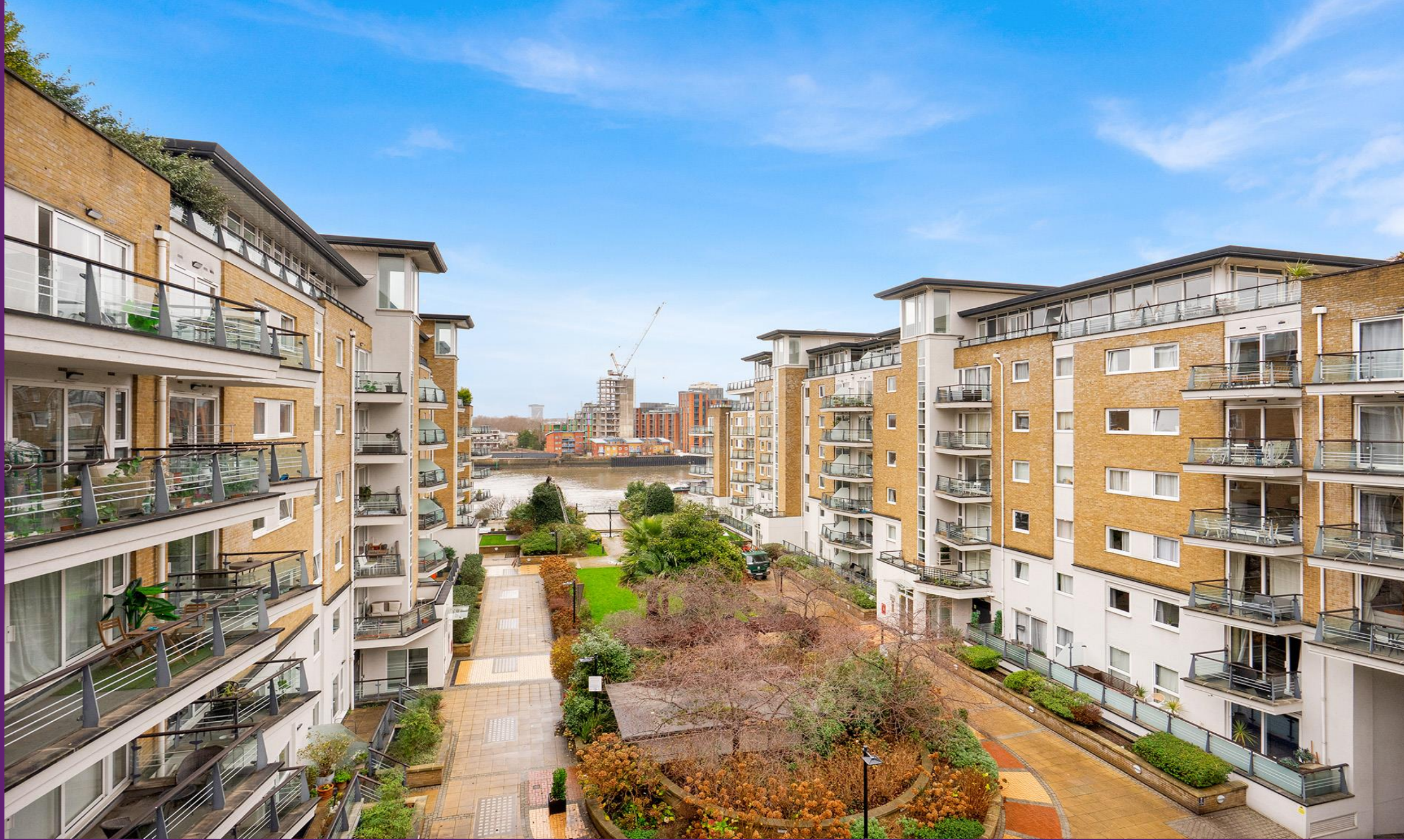
Bluewater House Smugglers Way, SW18