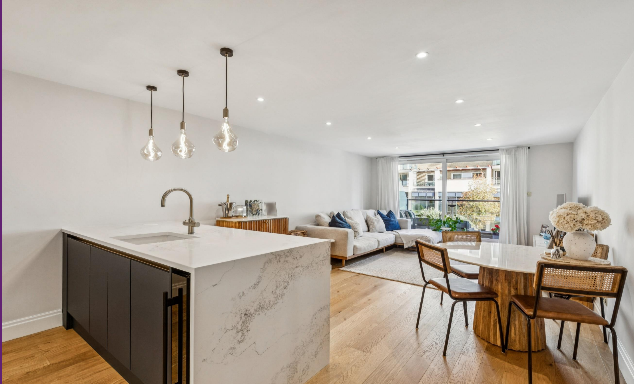
Compass House Smugglers Way, SW18