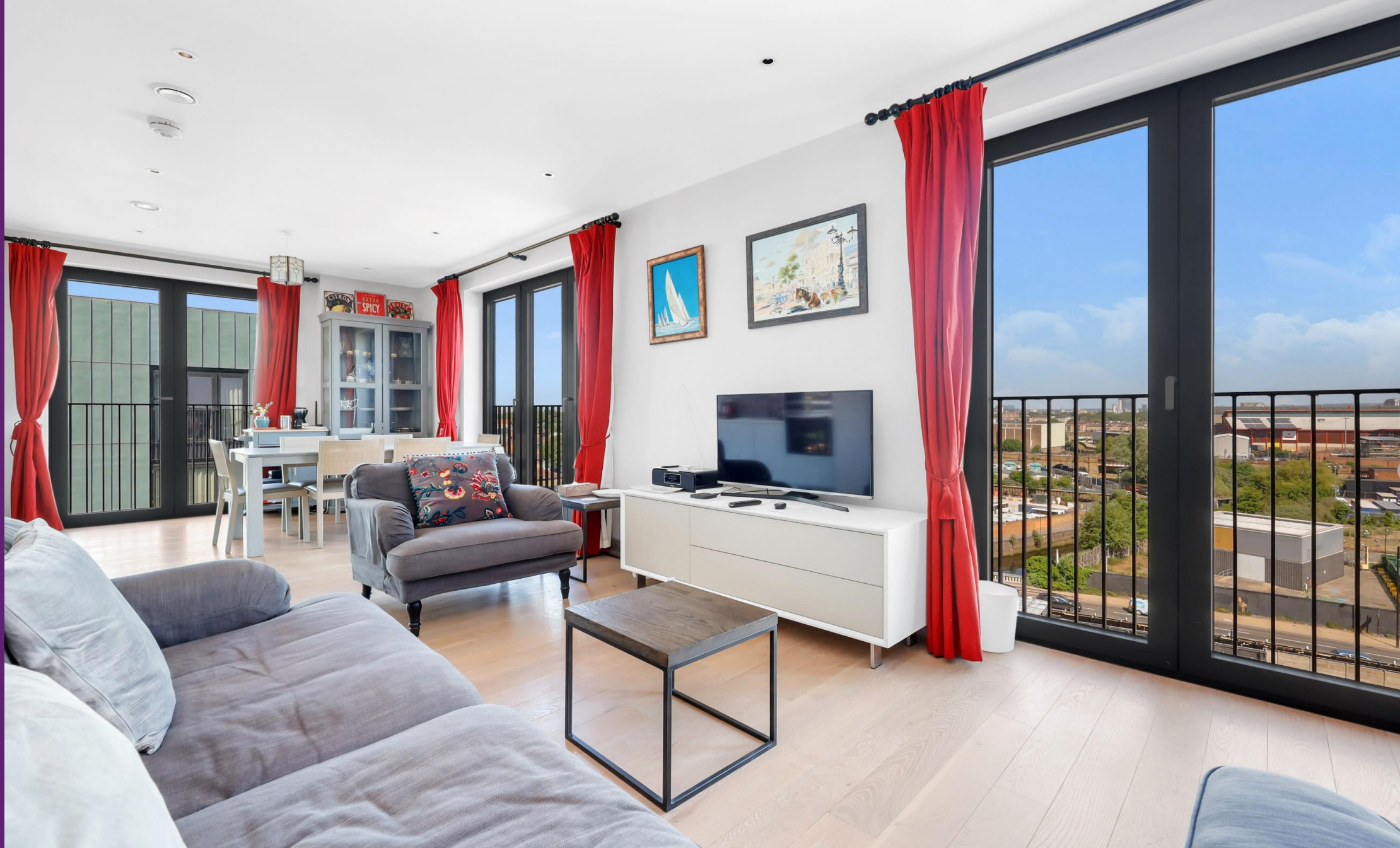
Cummings House 11 Chivers Passage, SW18