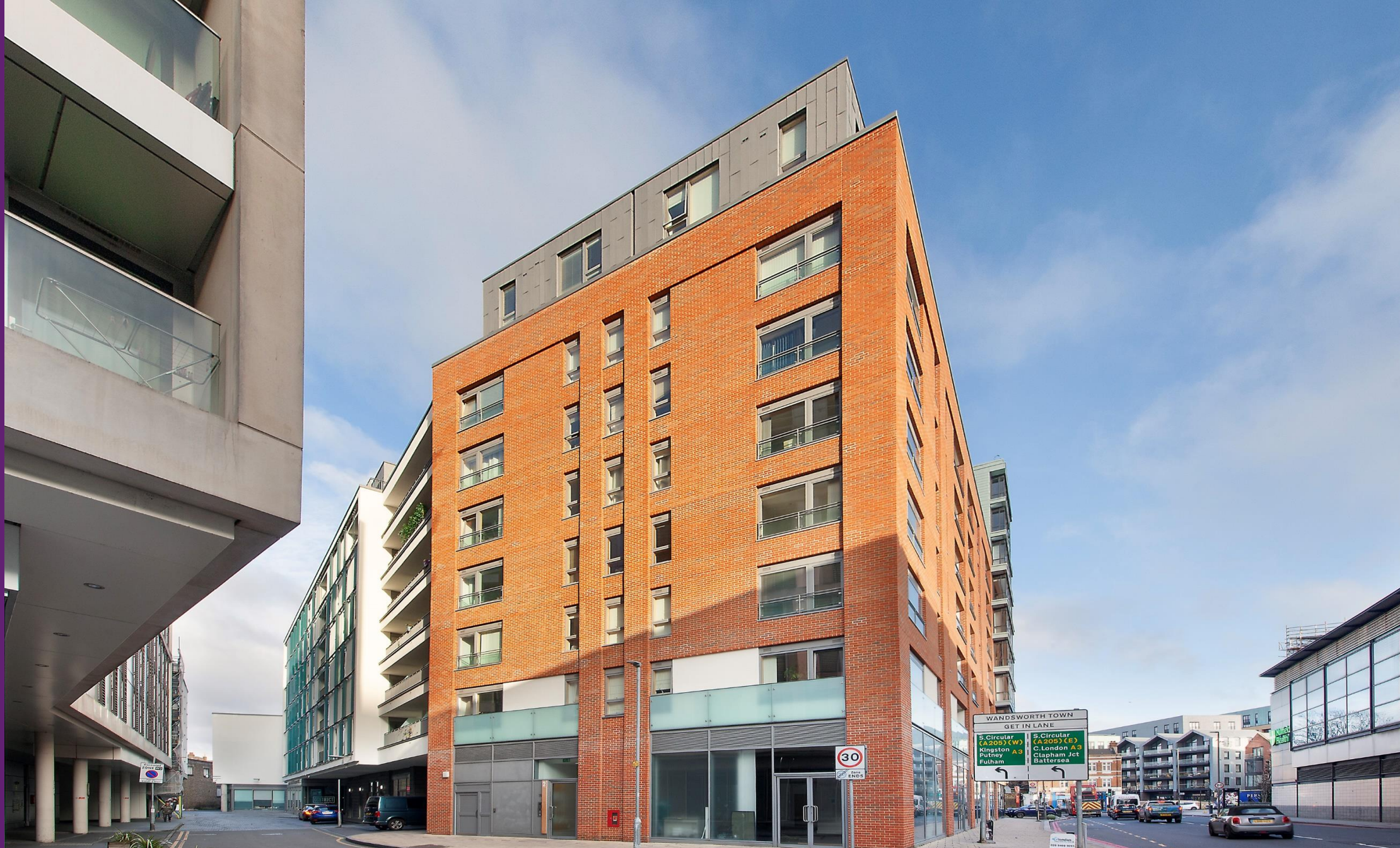
Hardwicks Square London, SW18