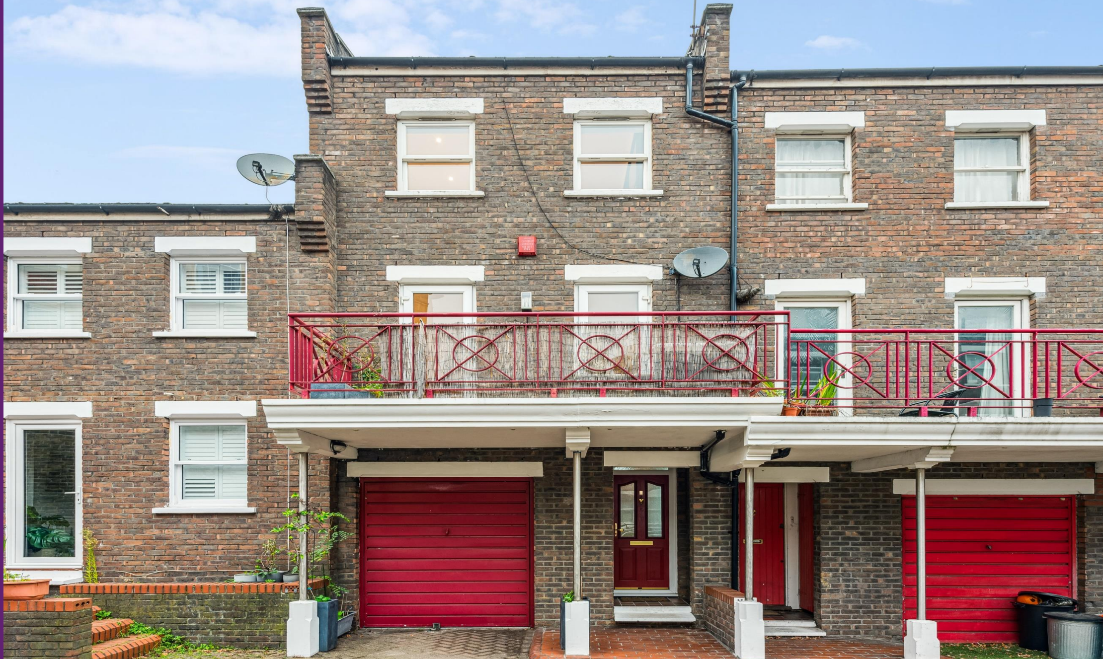
Downbury Mews London, SW18