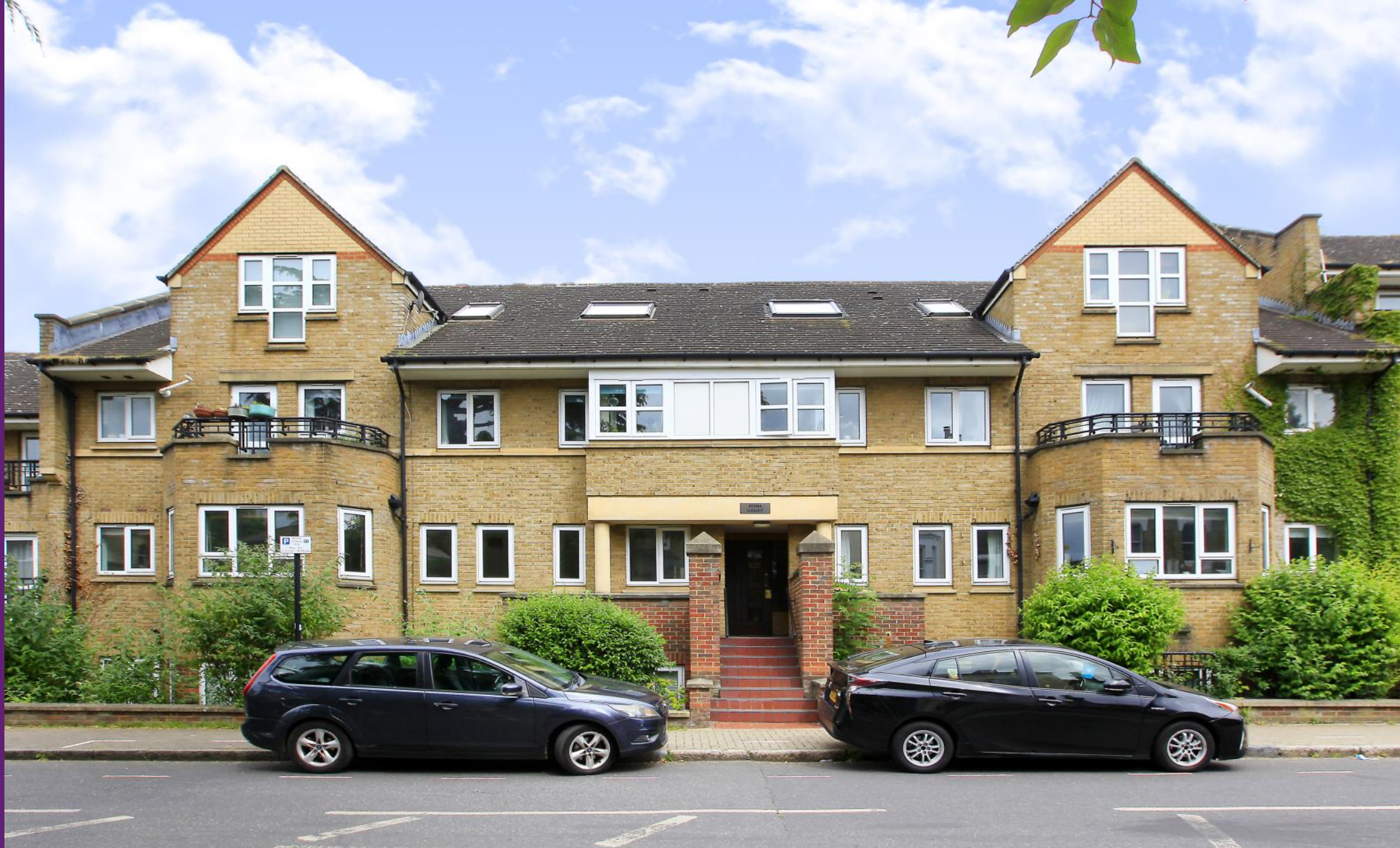
Roma Court 64 St James's Drive, SW12