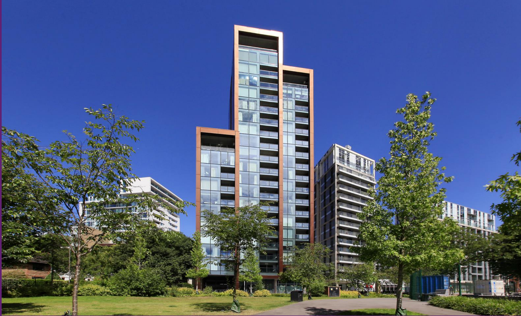
Bronze Building 18 Buckhold Road, SW18