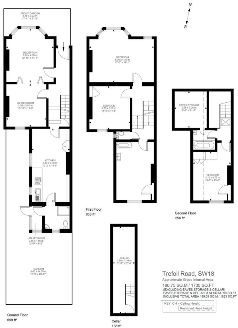
Illustration for identification purposes only. Not to scale. Floor Plan Drawn According To RICS Guidelines.

Chesterton Global Ltd trading as Chestertons for themselves and for the vendor of this property whose agents they are, give notice that (i) these particulars do not constitute any part of an offer or contract, (ii) all statements contained within these particulars are made without responsibility on the part of Chestertons or the vendor, (iii) whilst made in good faith, none of the statements contained within these particulars are to be relied upon as a statement or representation of fact, (iv) any intending purchasers must satisfy themselves by inspection or otherwise as to the correctness of each of the statements contained within these particulars, (v) the vendor does not make or give either Chestertons or any person in their employment any authority to make or give representation or warranty whatsoever in relation to this property. Wide angle lenses may be used. ©Copyright Chestertons | Chesterton Global Ltd | Registered Office 40 Connaught Street, Hyde Park, London W2 2AB Registered Company Number 05334580.