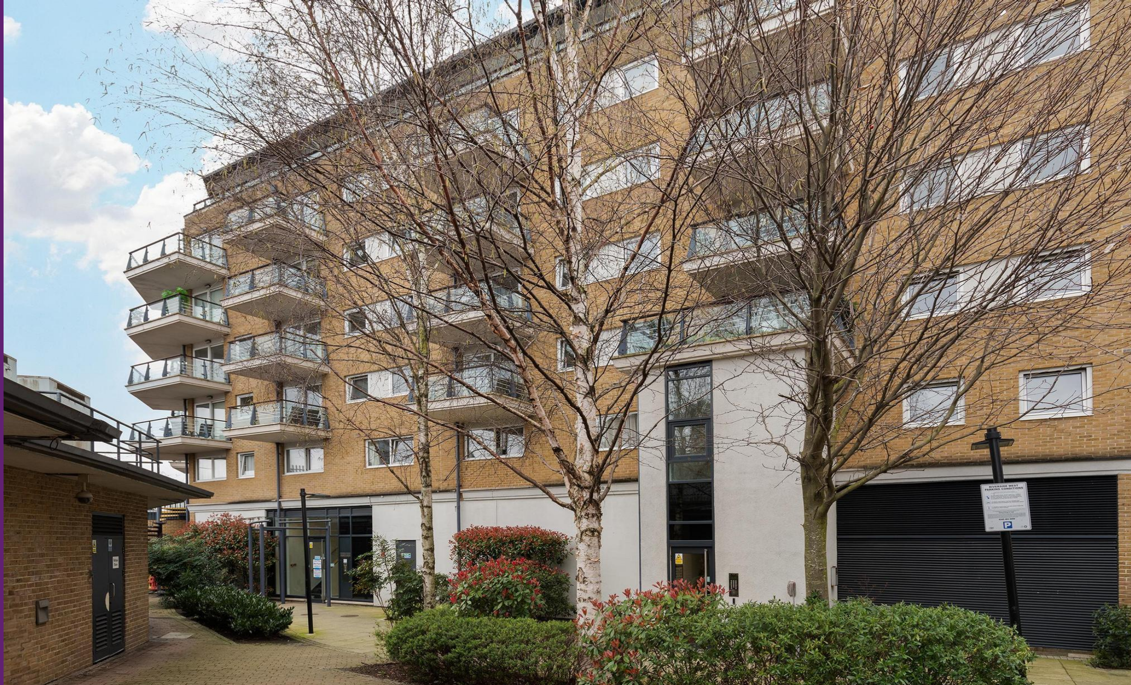
Omega Building Smugglers Way, SW18