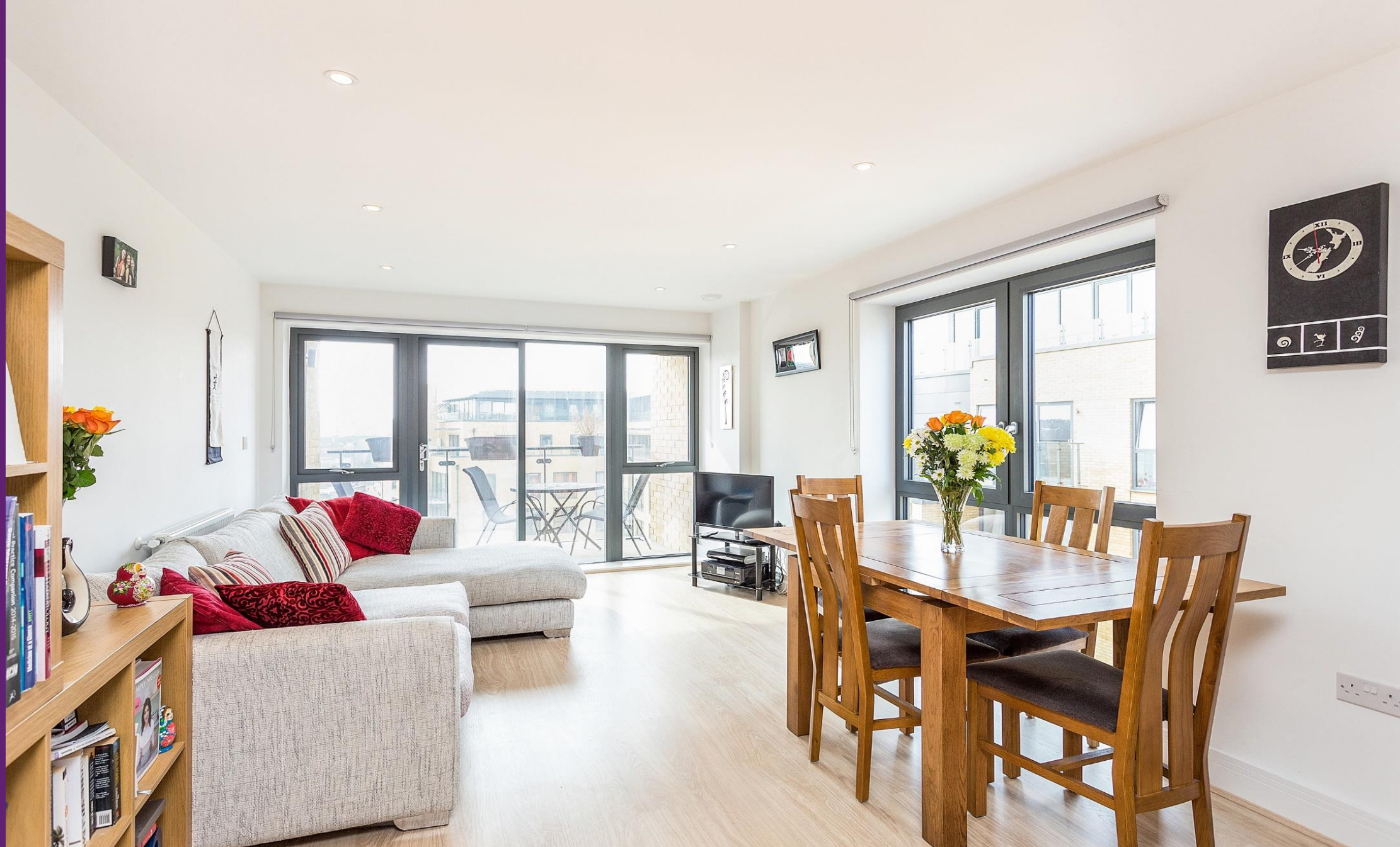
Knightley Walk London, SW18