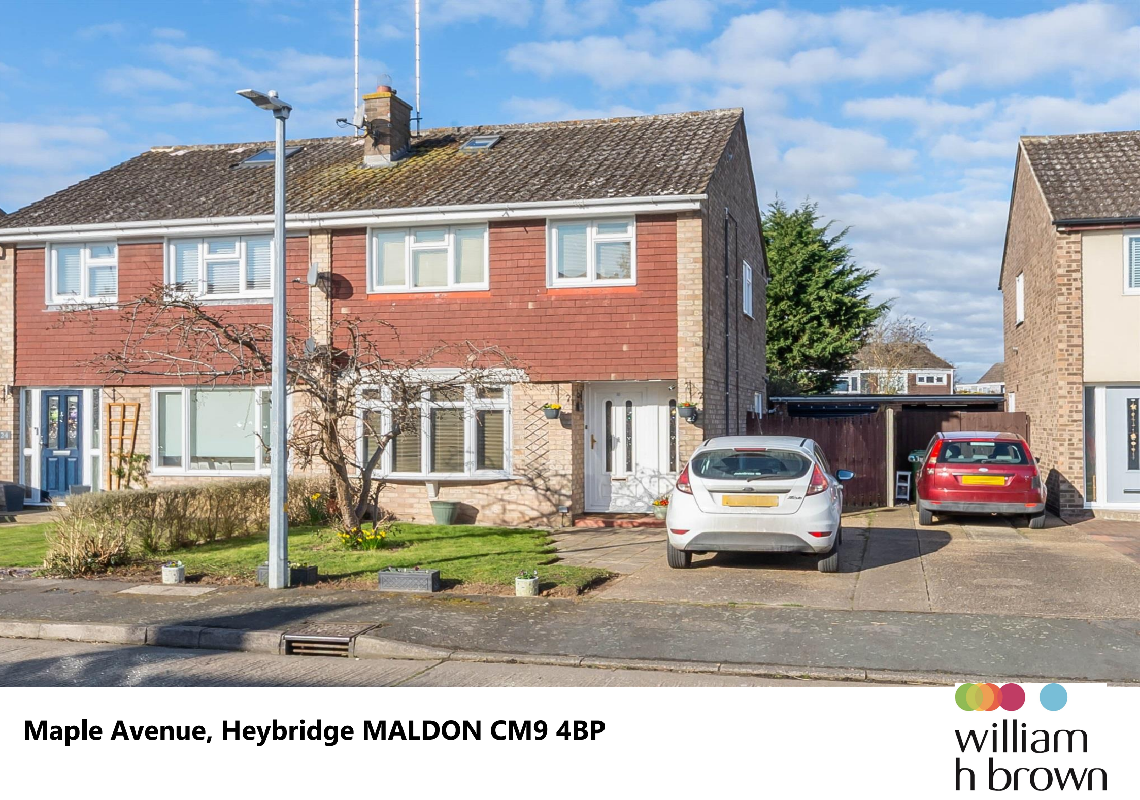
Maple Avenue, Heybridge MALDON CM9 4BP