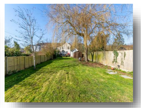
Scarborough Rd Scarborough Rd Scarborough Rd