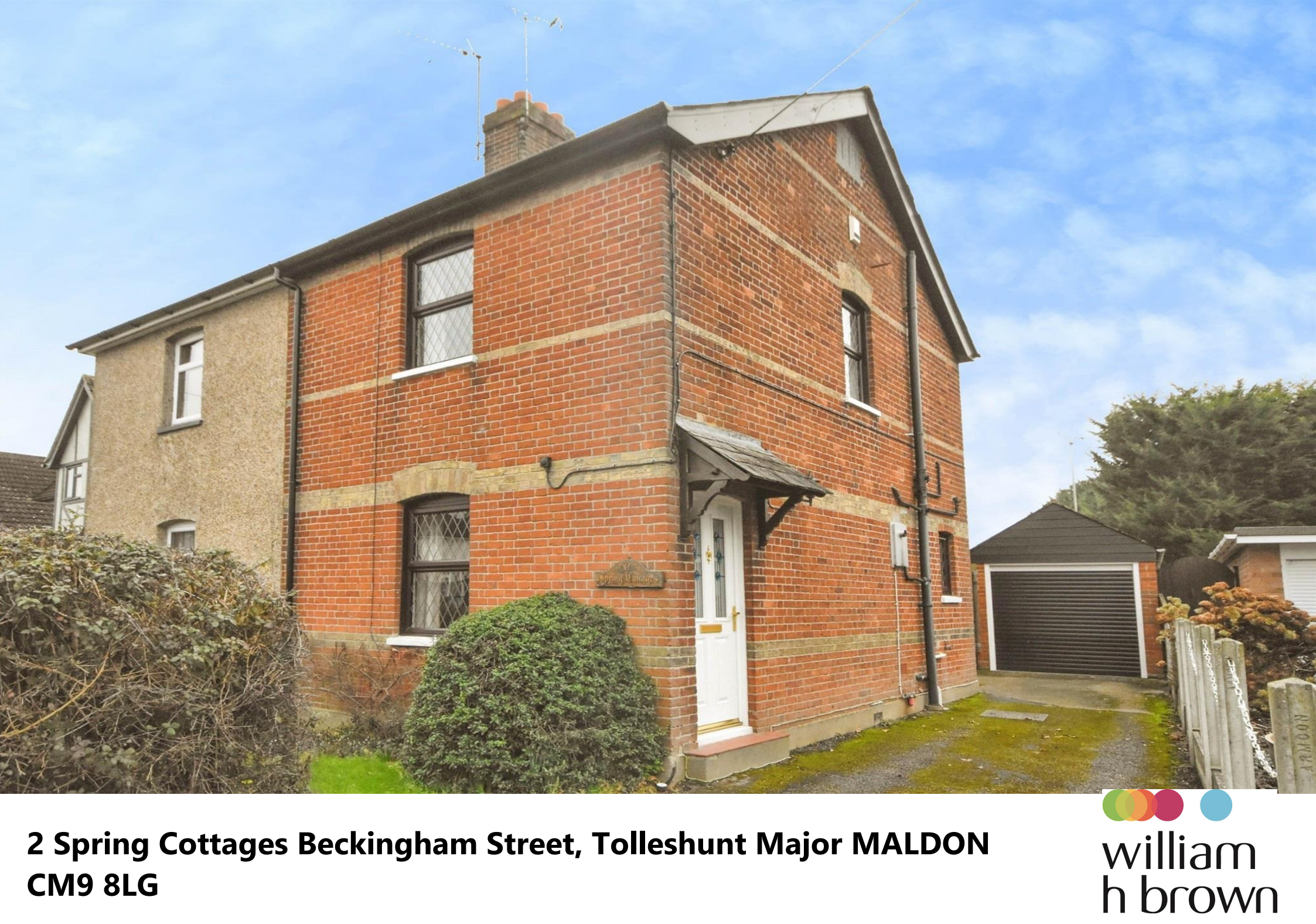
2 Spring Cottages Beckingham Street, Tolleshunt Major MALDON CM9 8LG