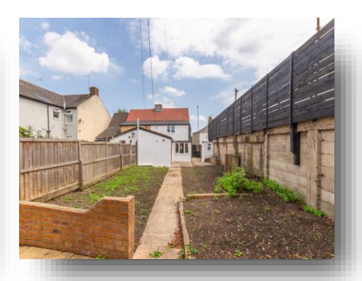
Tenterfield Rd Maldon District Council