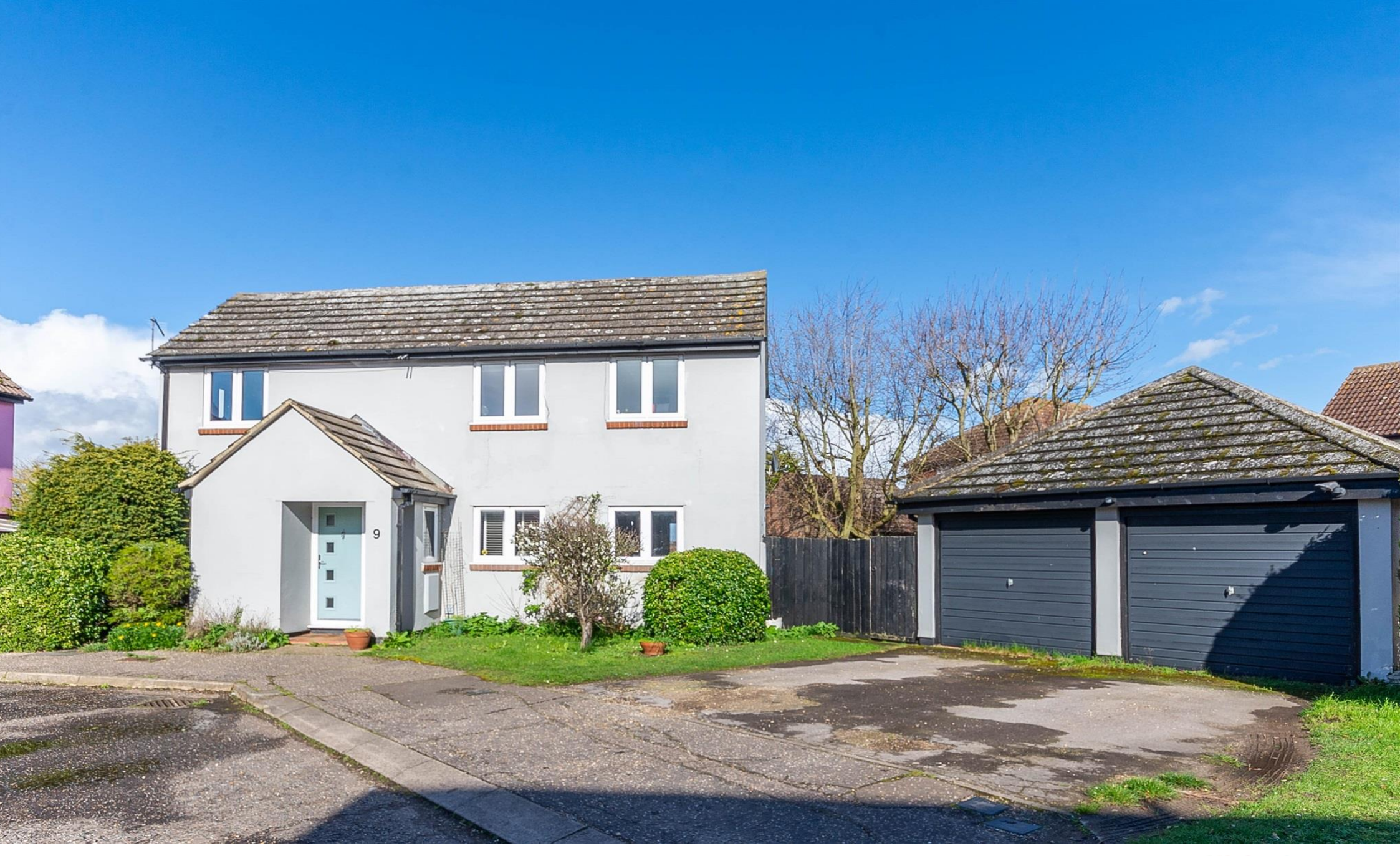
The Colliers, Heybridge Basin MALDON CM9 4SE