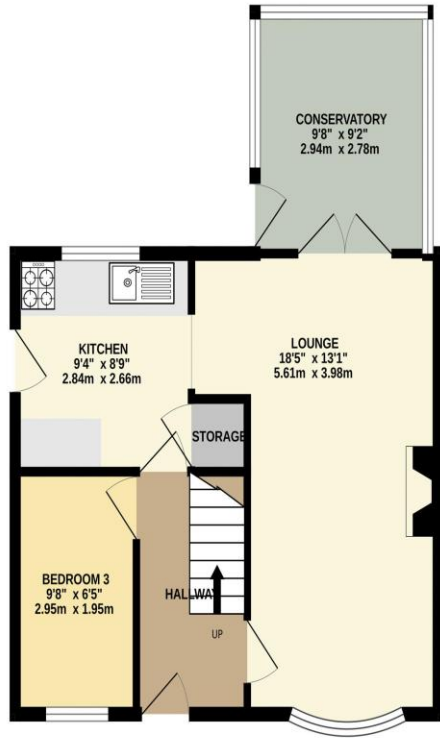
GROUND FLOOR 497 sq.ft. (46.2 sq.m.) approx.