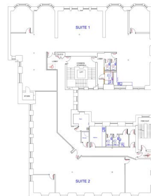
FLOOR PLAN FOR INDICATIVE PURPOSES ONLY