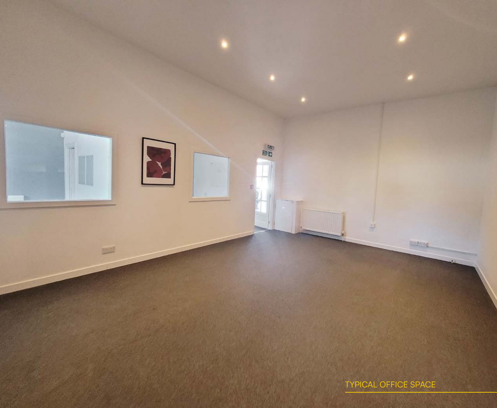
TYPICAL OFFICE SPACE