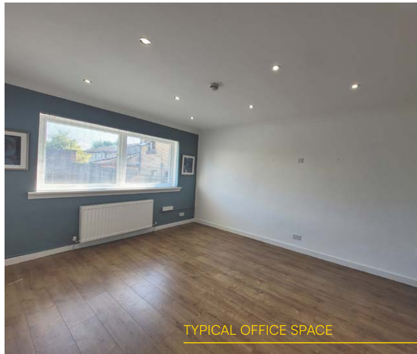
TYPICAL OFFICE SPACE