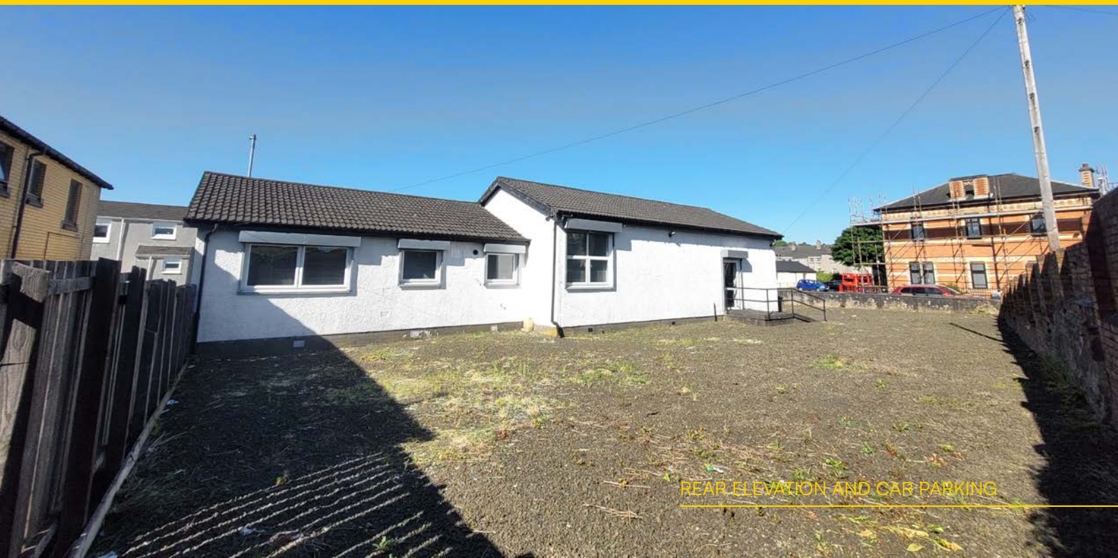
REAR ELEVATION AND CAR PARKING