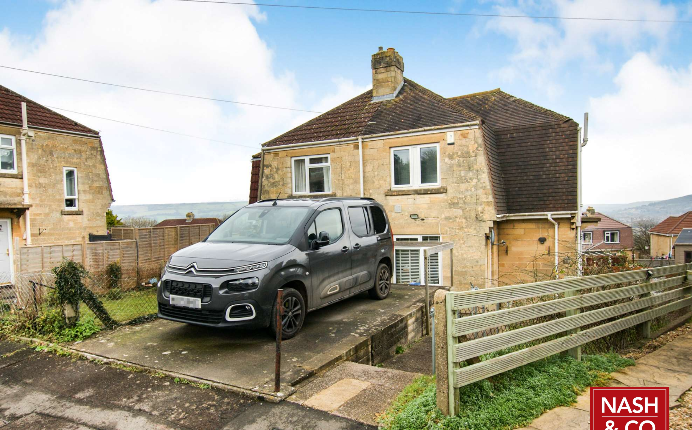
East Close Whiteway | Bath