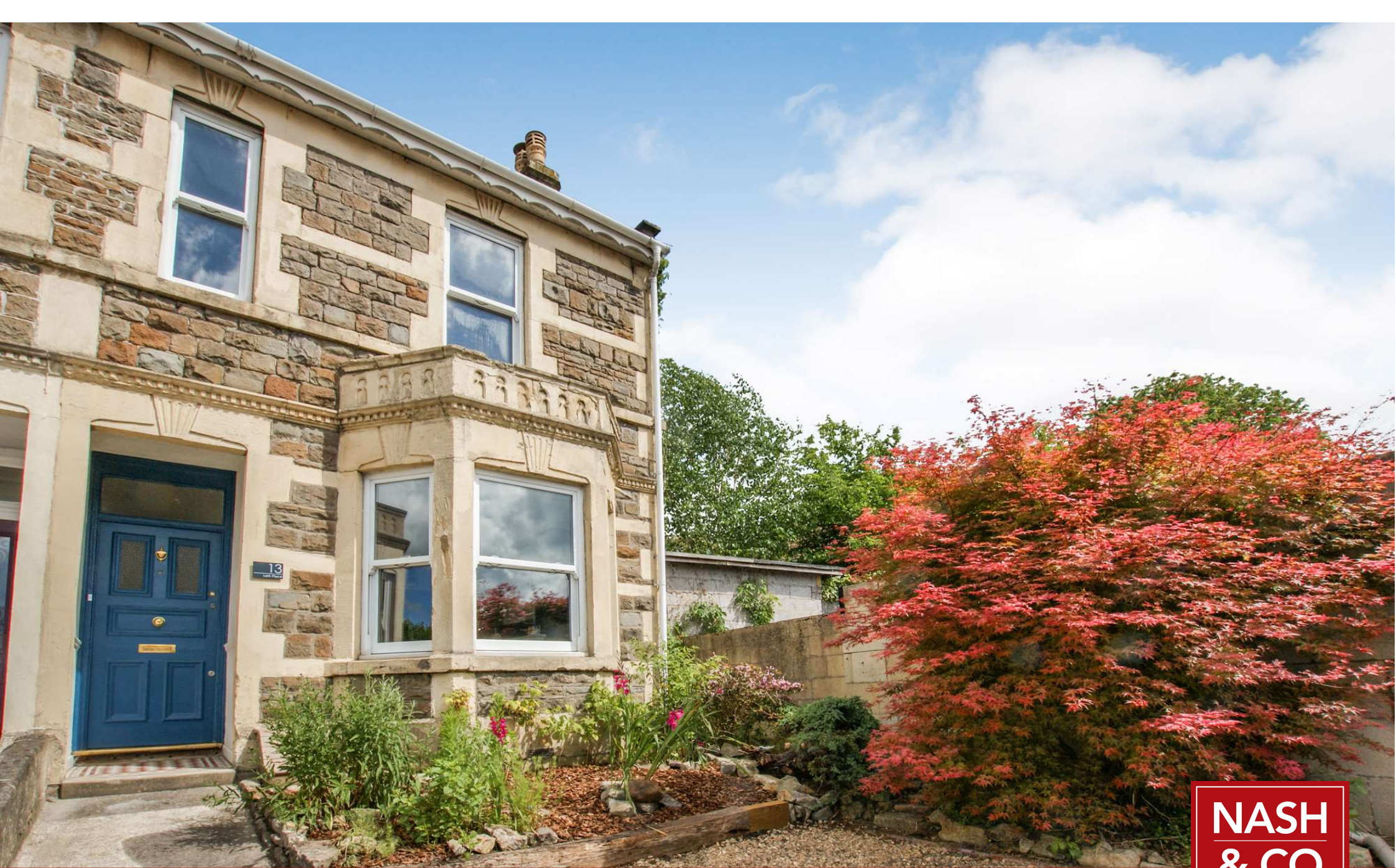
Lark Place Lower Weston | Bath