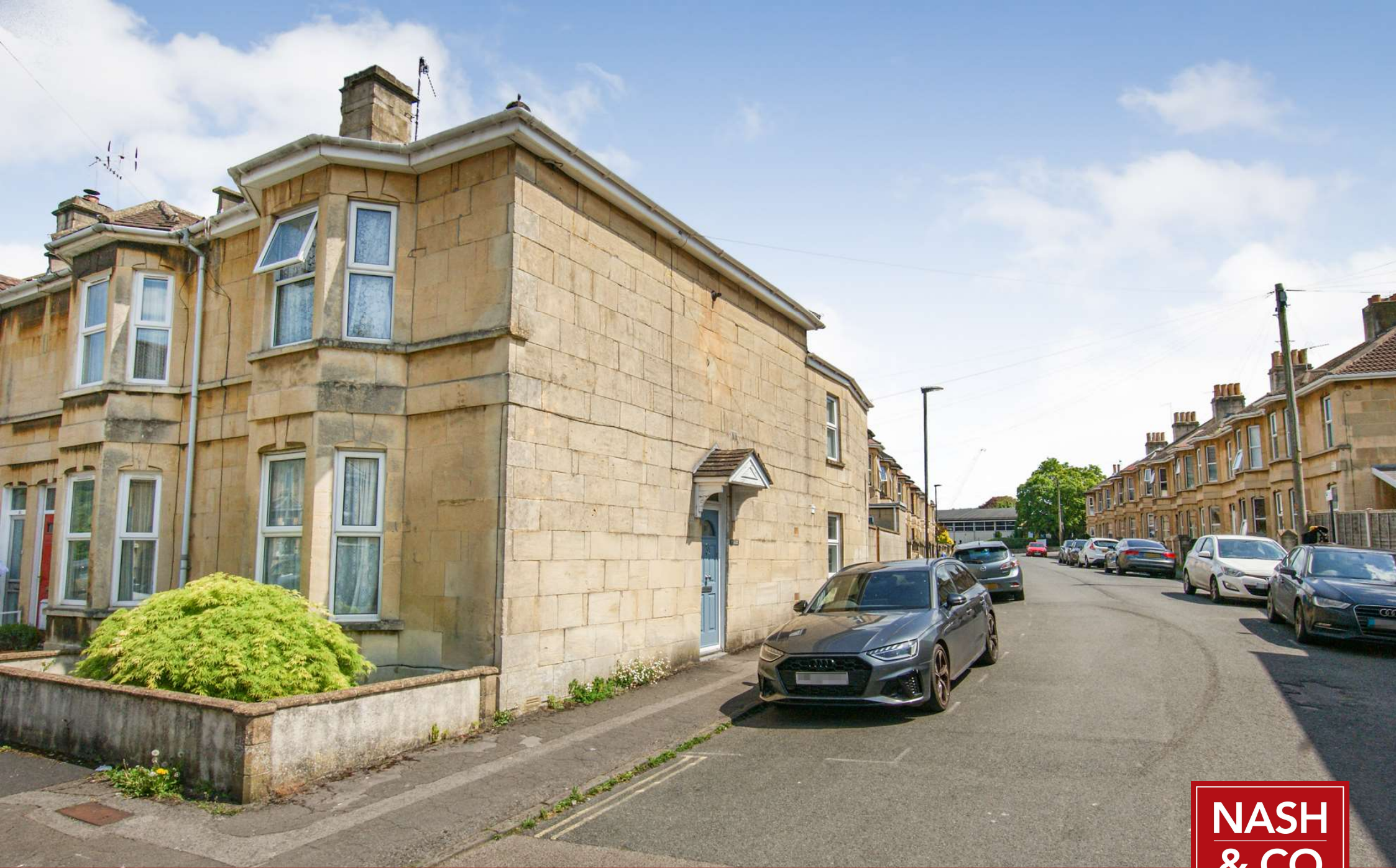
Victoria Terrace, Bath