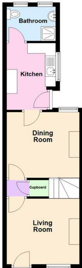
Ground Floor Approx. 37.0 sq. metres (398.0 sq. feet)