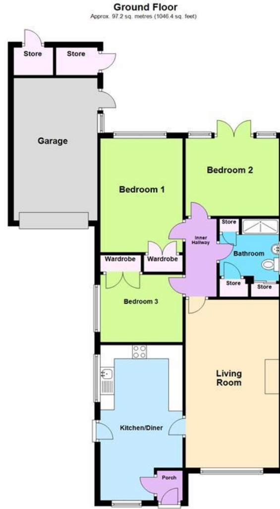
Total area: approx. 97.2 sq. metres (1046.4 sq. feet)

This floor plan is not drawn to scale and is for illustration purposes only