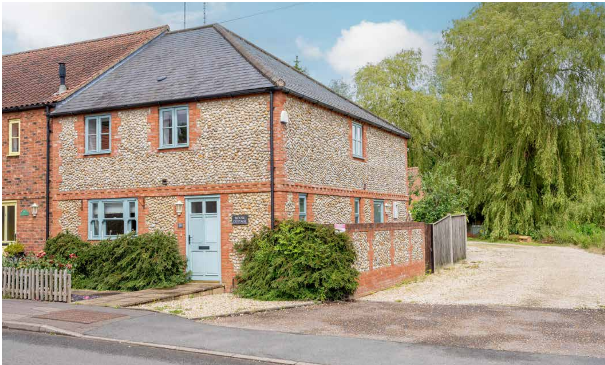
Mouse Cottage Litcham | Norfolk | PE32 2NS