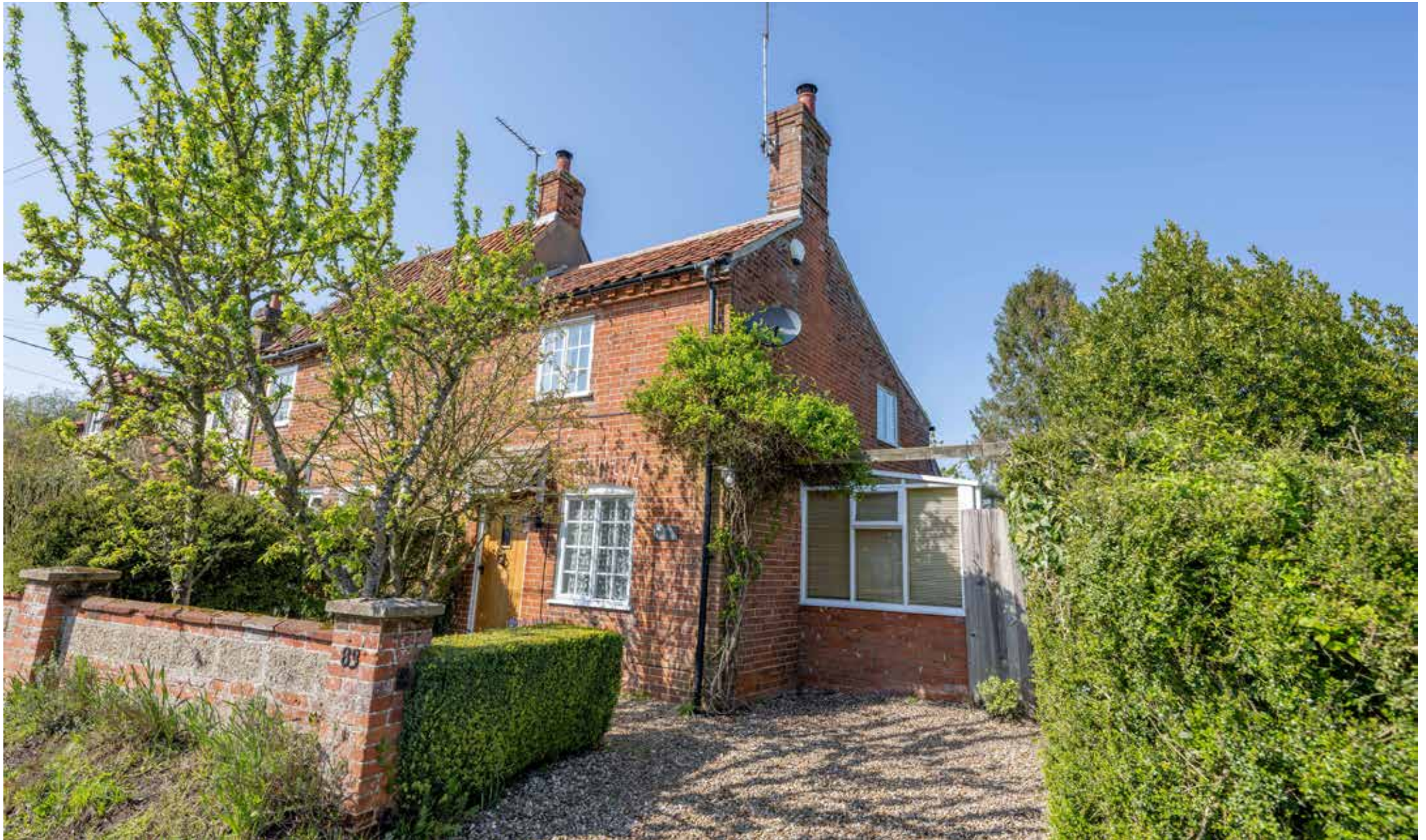
Bumblebee Cottage Hindolveston | Norfolk | NR20 5DD