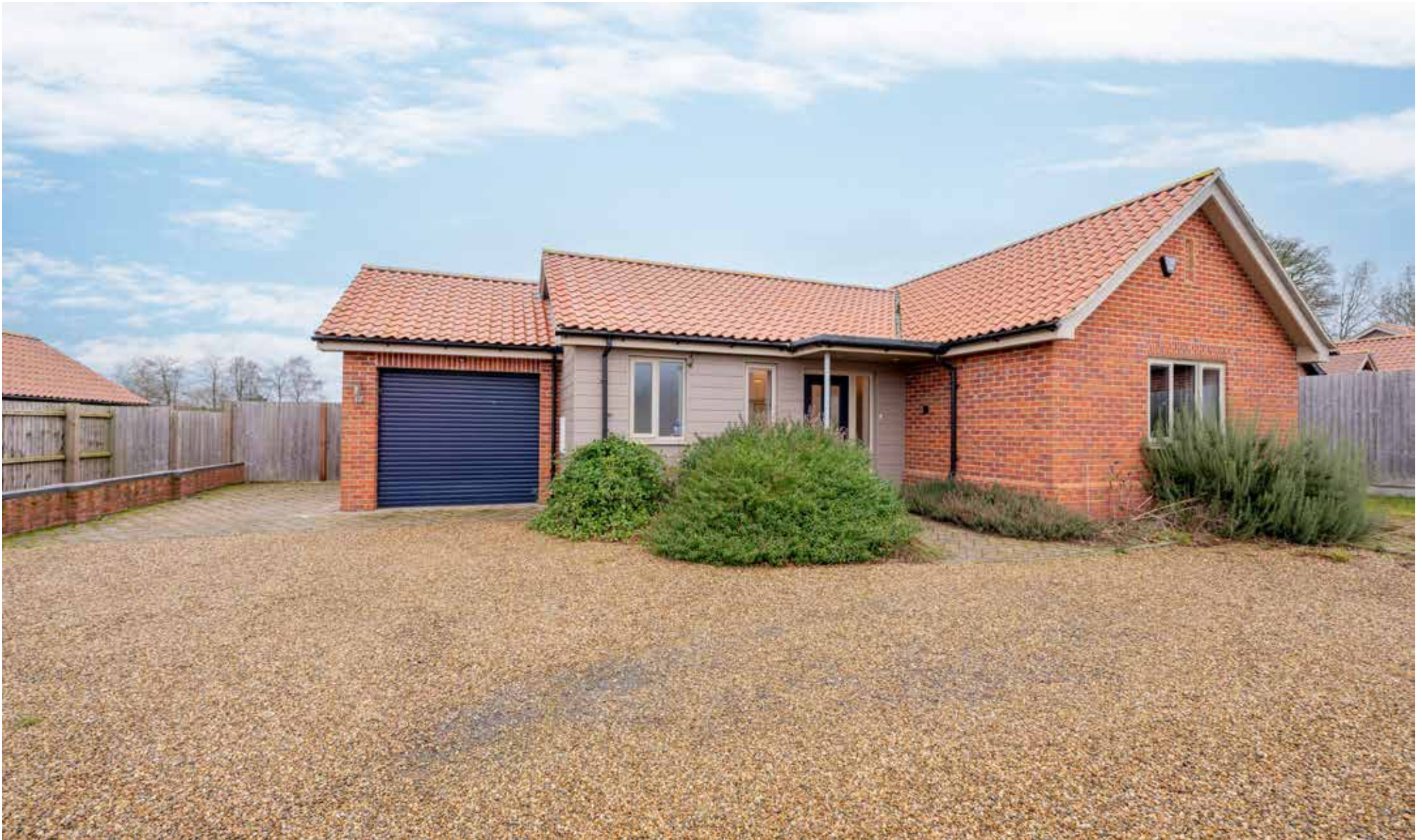
3 The Glade Guist | Norfolk | NR20 5AQ