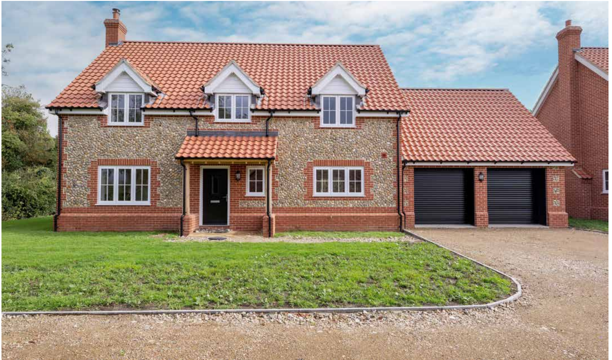
2 Durrant Close Whissonett | Norfolk | NR20 5ST