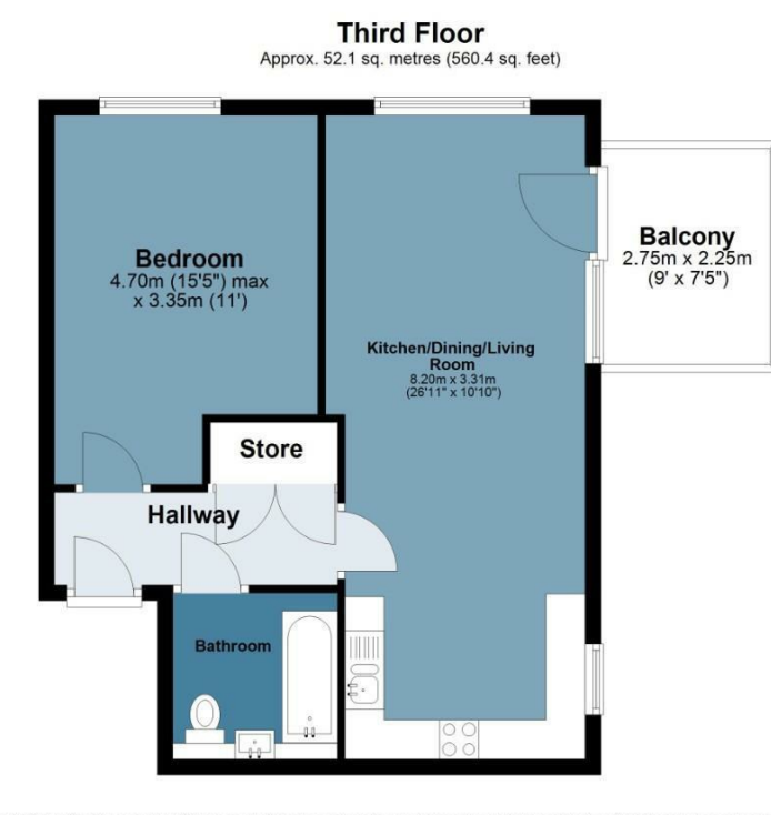
Measurements are approximate and for illustration purposes only. While we do not doubt the accuracy and completeness, we advise you conduct a careful independent assessment of the property to determine monetary value.

IMPORTANT NOTICE - These particulars have been prepared in good faith and they are not intended to constitute part of an offer or contract. We have not performed a structural survey on this property and the services, appliances and specific fittings have not been tested. All photographs, measurements, floor plans and distances referred to are given as a guide and should not be relied upon.