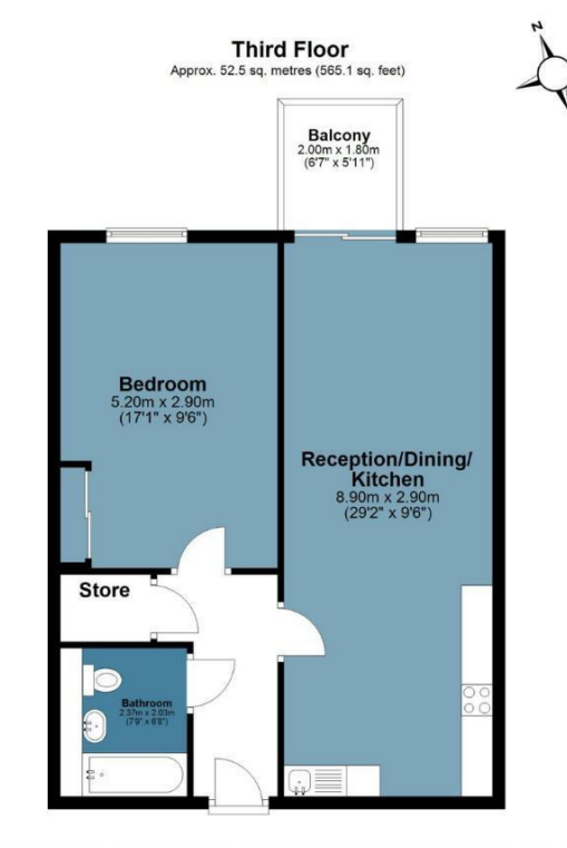
Measurements are approximate and for illustration purposes only. While we do not doubt the accuracy and completeness, we advise you conduct a careful independent assessment of the property to determine monetary value

Approx. Gross Internal Area 52.2 sq. metres (565.1 sq. feet)