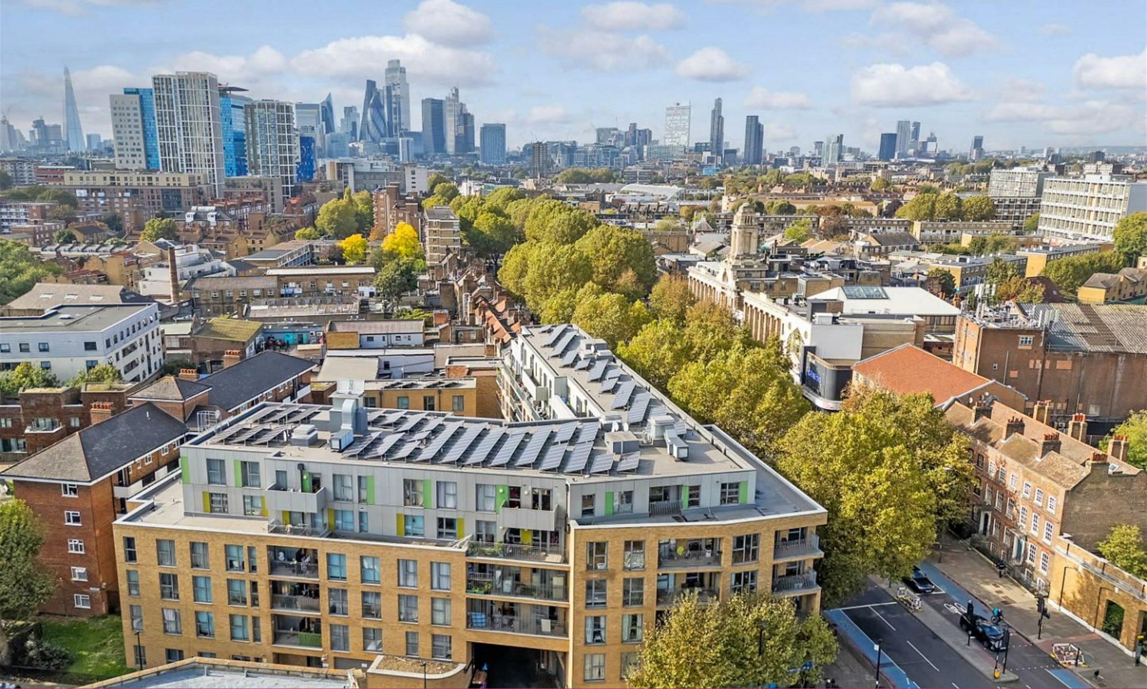
Fulneck Place, London, E1