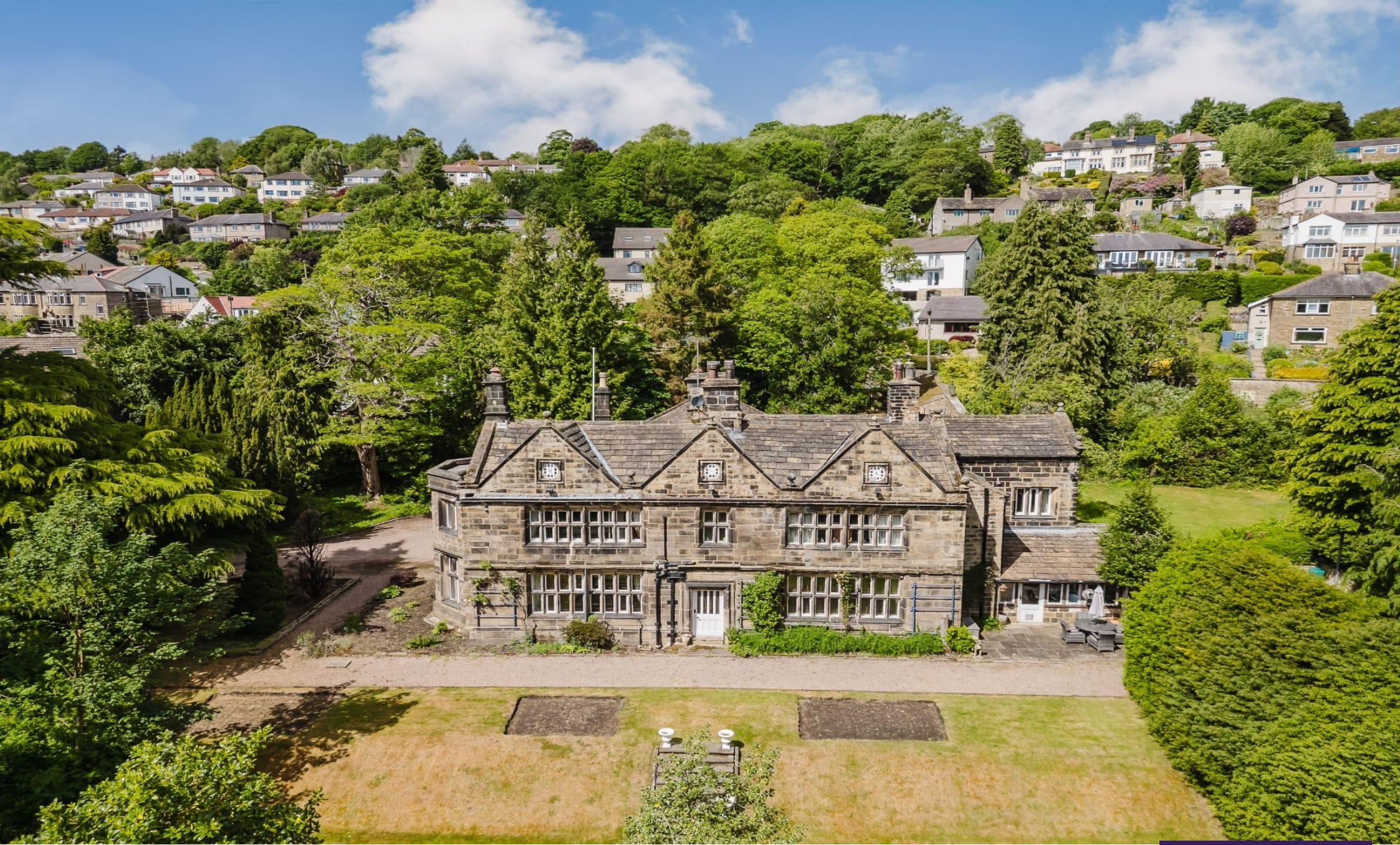
West Riddlesden Hall Scott Lane, Riddlesden Keighley BD20 5BU