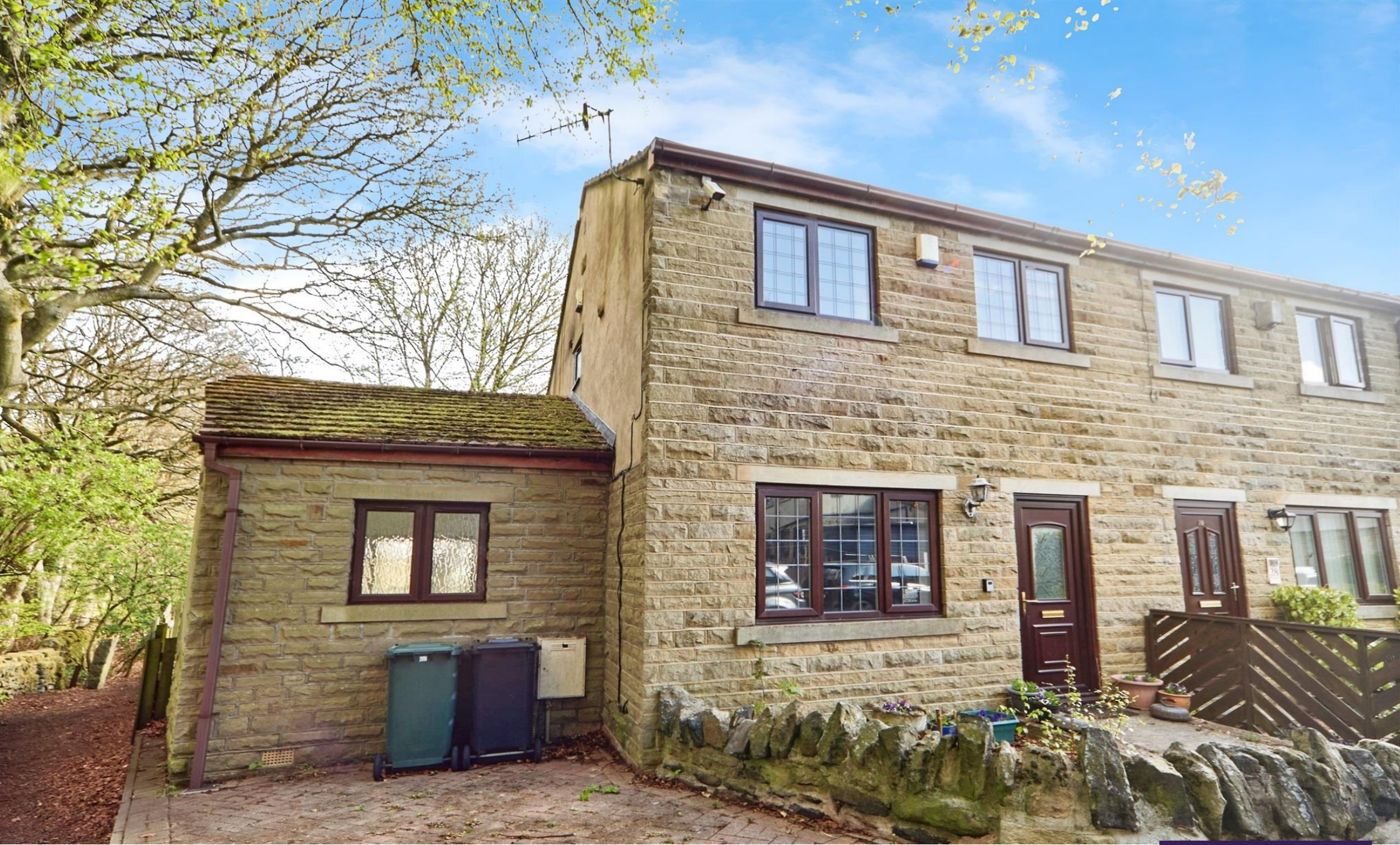
Delph Croft View, Keighley BD21 4PB