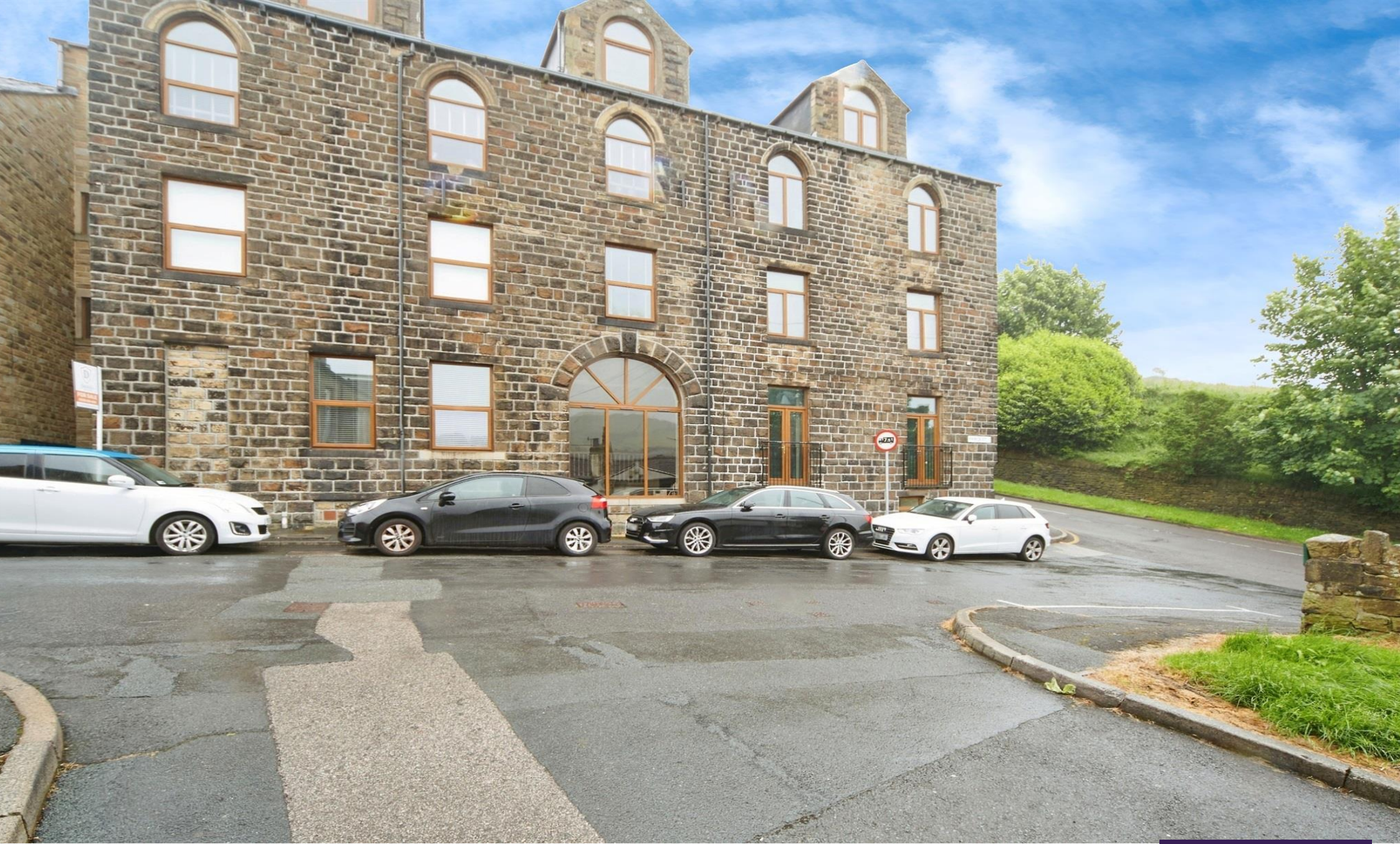
The Old Brewery Prince Street, Haworth Keighley BD22 8LE