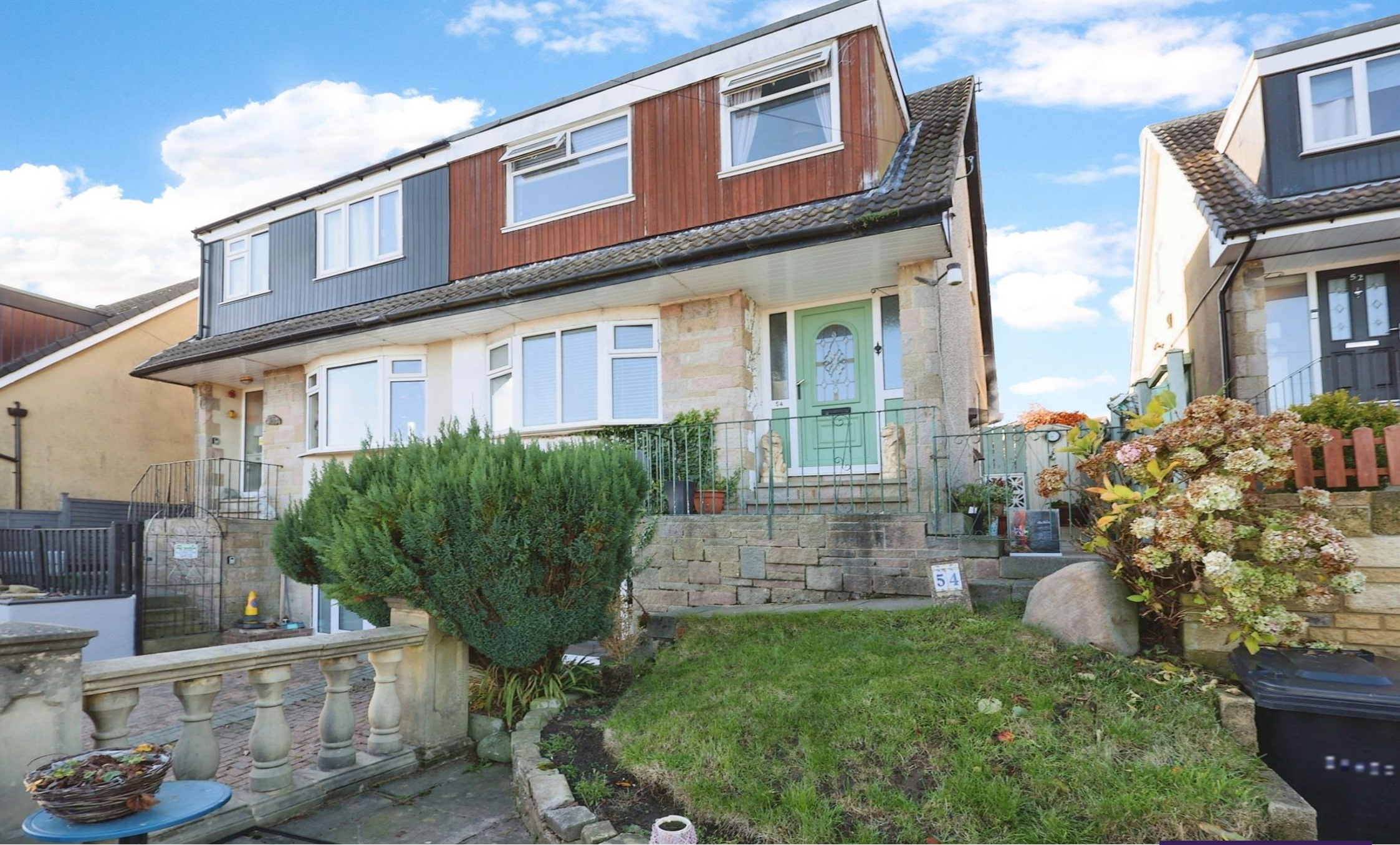
Harewood Crescent, Oakworth Keighley BD22 7NJ