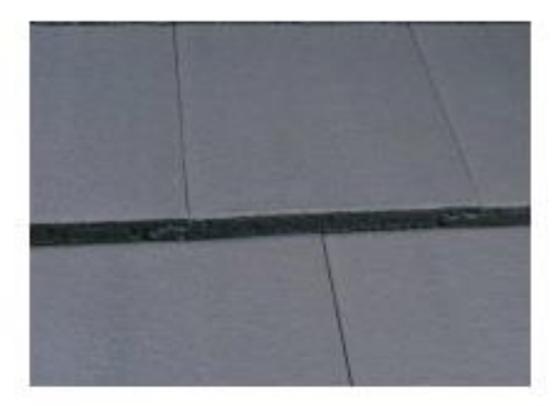
Root Tile Marley Modern 'Smooth Grey [or Sandtoft equivalent]