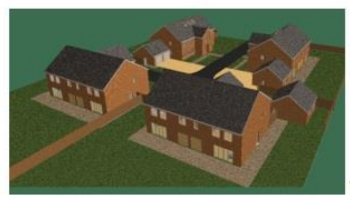
View of plots 3-6 from NW