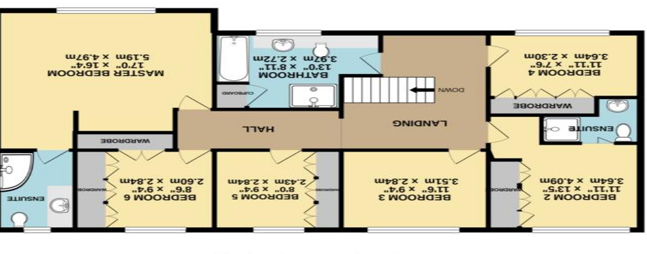
1202 sq.ft. (111.7 sq.m.) approx.