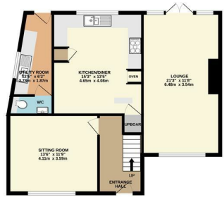
GROUND FLOOR 762 sq.ft. (70.8 sq.m.) approx.