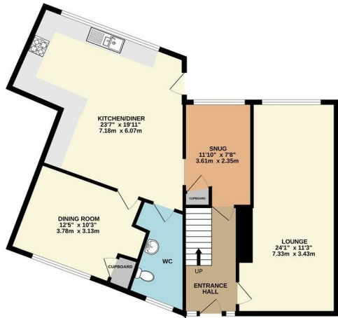
GROUND FLOOR 907 sq.ft. (84.3 sq.m.) approx.