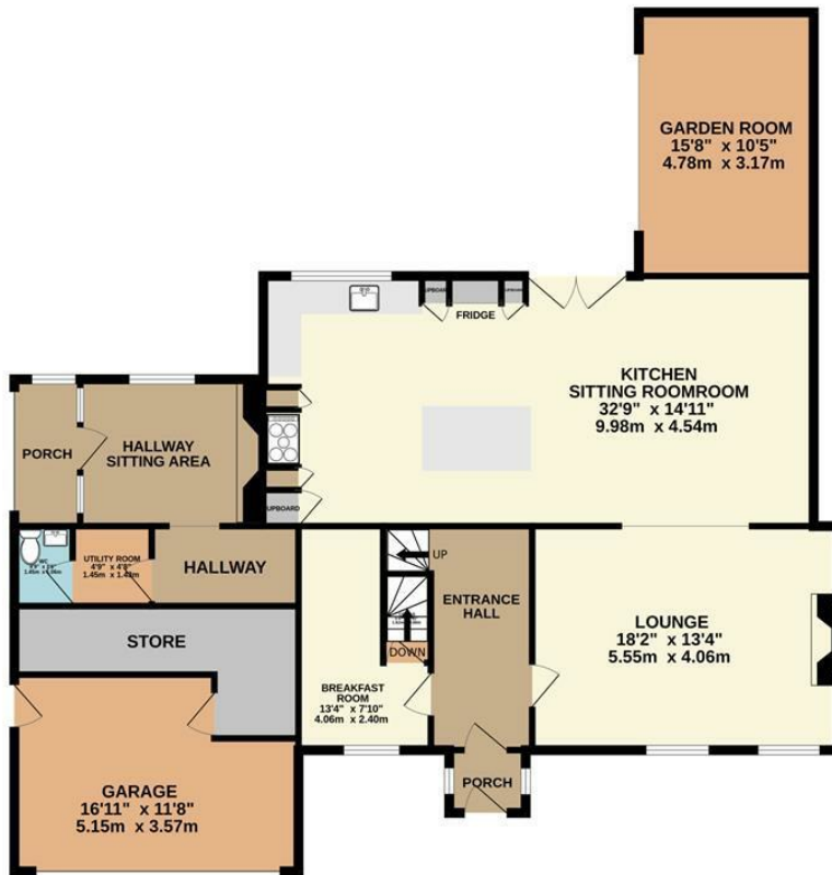
GROUND FLOOR 1553 sq.ft. (144.2 sq.m.) approx.