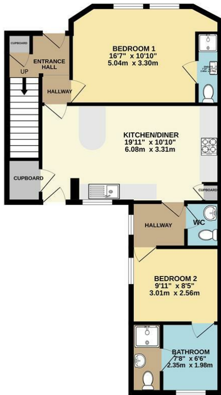
GROUND FLOOR 695 sq.ft. (64.5 sq.m.) approx.