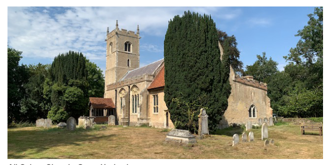
All Saints Church, Great Horkesley