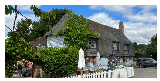
The Yew Tree Public House & Restaurant The Causway, Great Horkesley