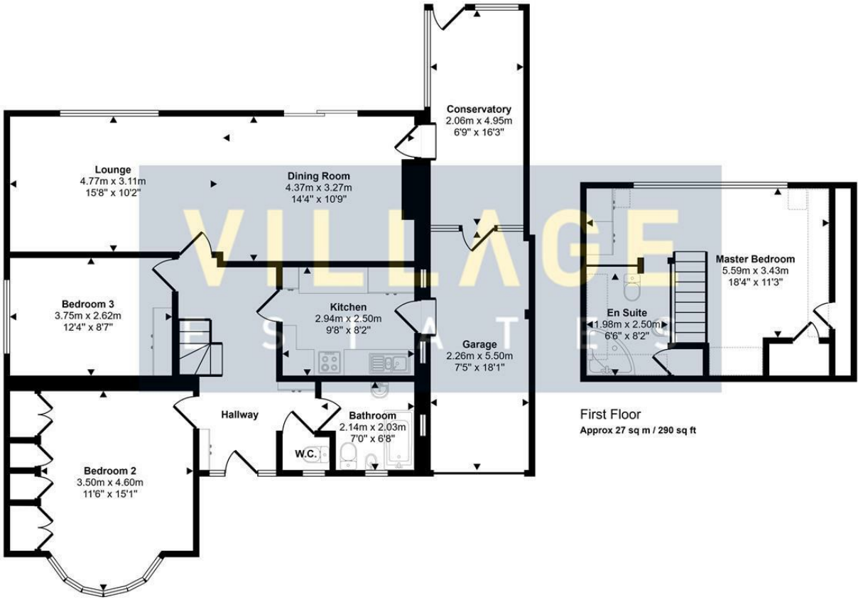
First Floor Approx 27 sq m / 290 sq ft

Approx Gross Internal Area 138 sq m / 1483 sq ft