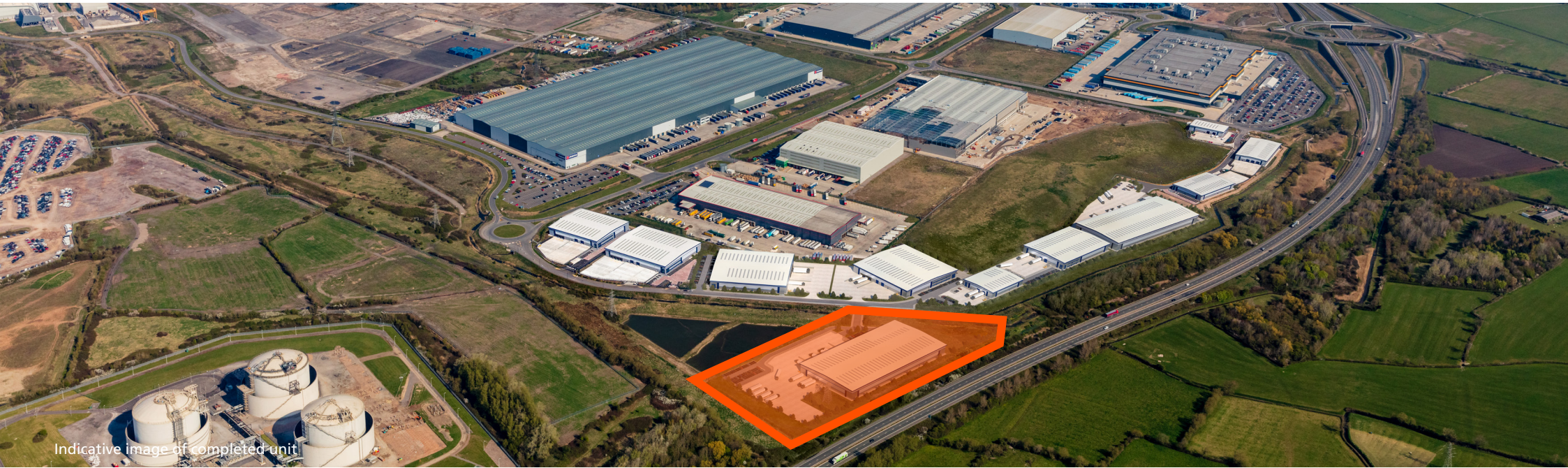
Indicative image of completed unit