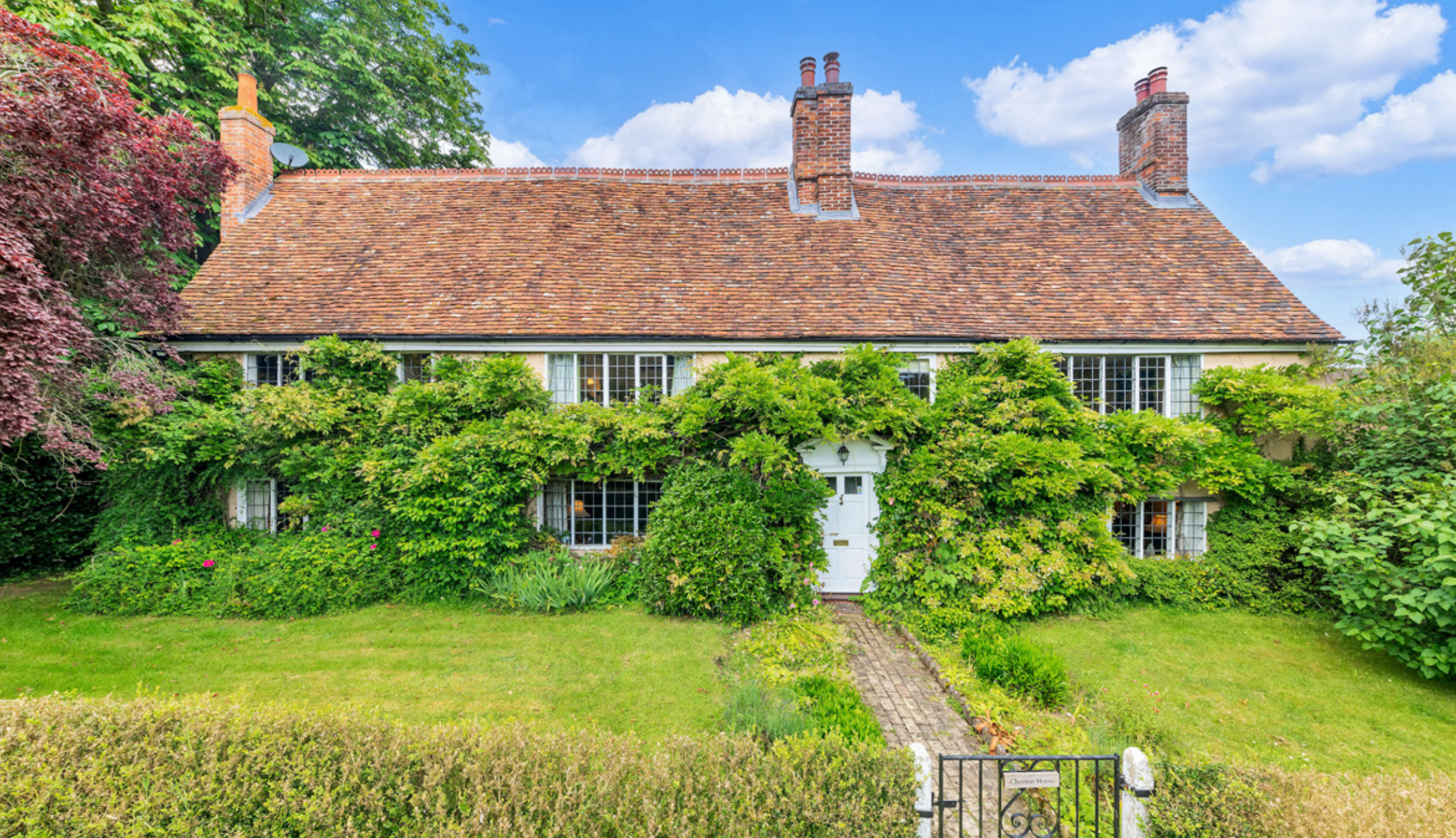
Chestnut House, Lamarsh, Essex