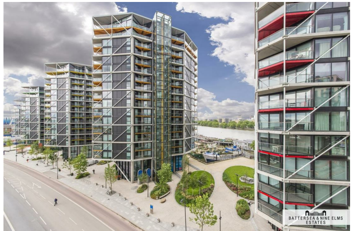
BATTERSEA & NINE ELMS ESTATES