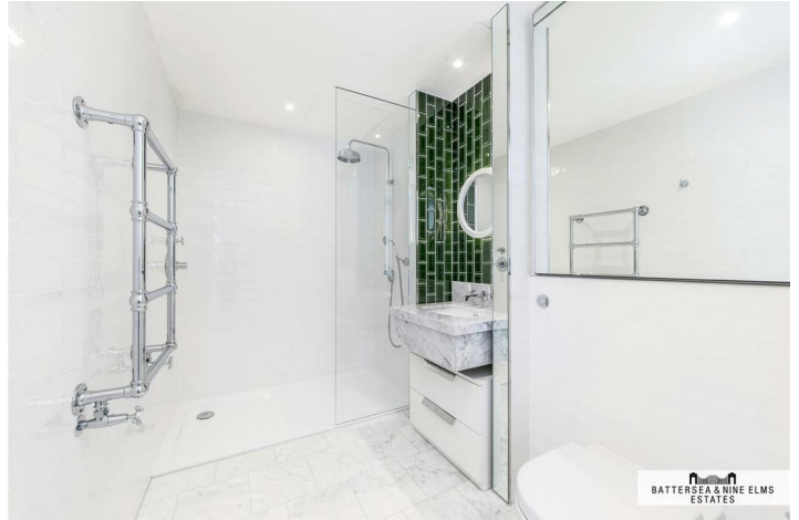
BATTERSEA & NINE ELMS ESTATES