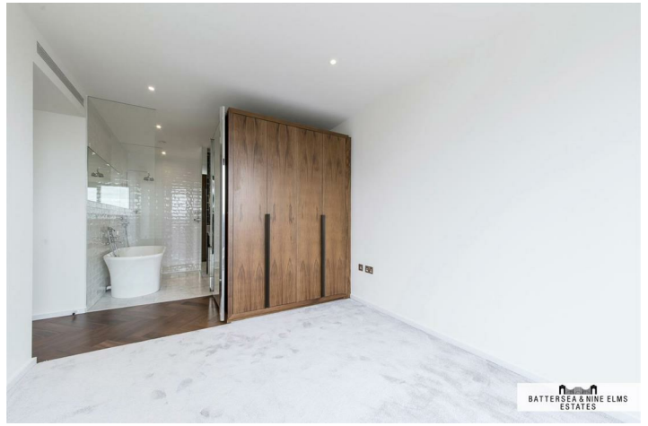
BATTERSEA & NINE ELMS ESTATES