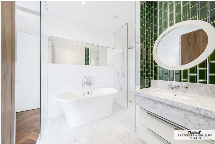
BATTERSEA & NINE ELMS ESTATES