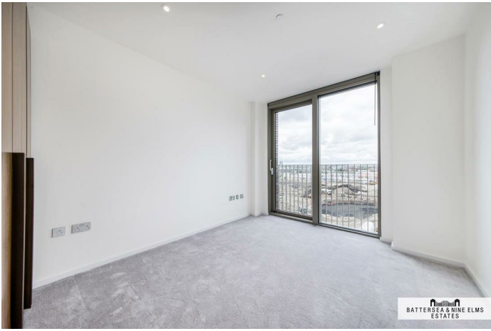
BATTERSEA & NINE ELMS ESTATES