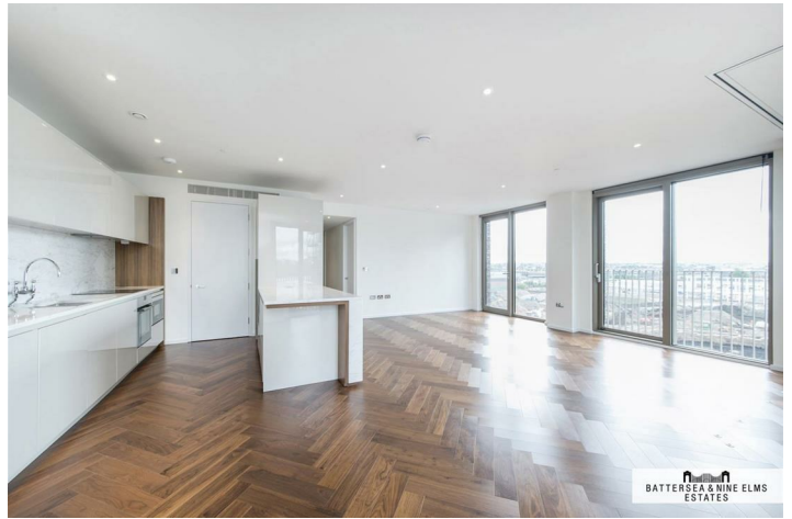
BATTERSEA & NINE ELMS ESTATES