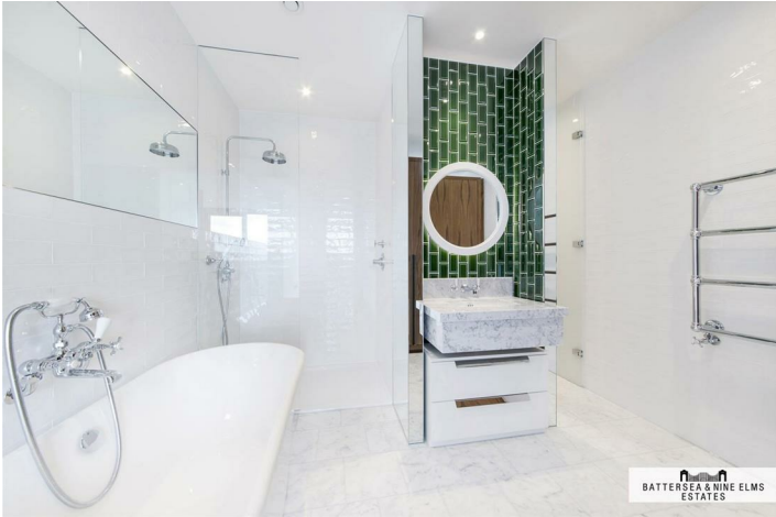
BATTERSEA & NINE ELMS ESTATES