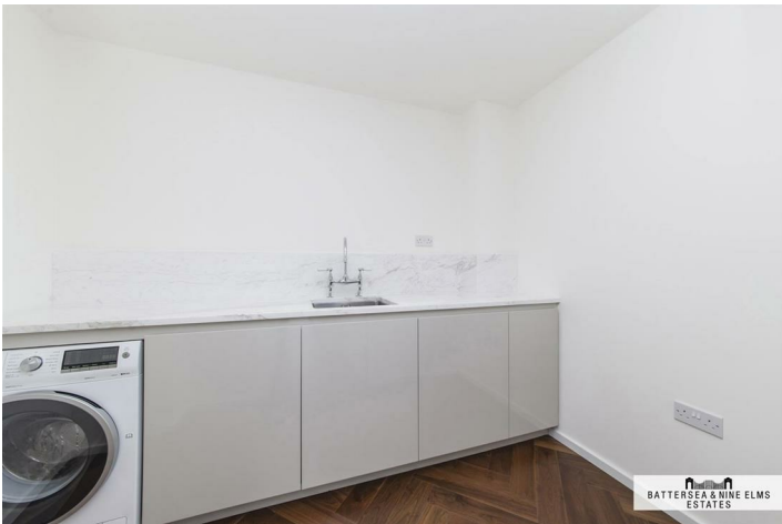
BATTERSEA & NINE ELMS ESTATES