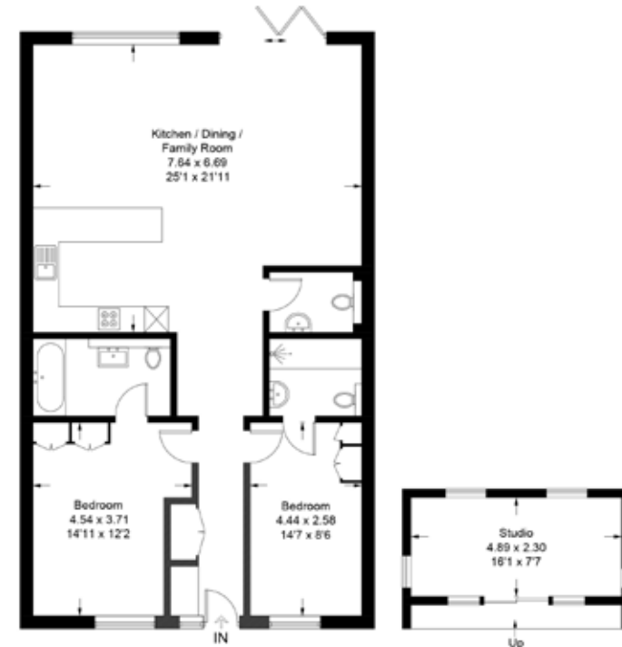
Illustration for identification purposes only, measurements are approximate, not to scale. Imageplansurveys @ 2024

A buyer is advised to obtain verification from the solicitor.