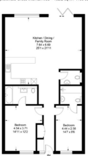
Illustration for identification purposes only, measurements are approximate, not to scale. Imageplansurveys @ 2023