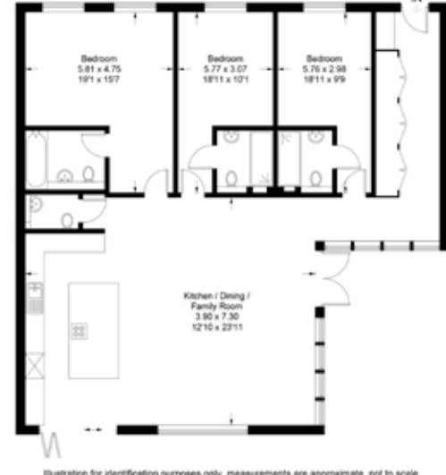
Illustration for identification purposes only, measurements are approximate, not to scale. Imageplansurveys @ 2023