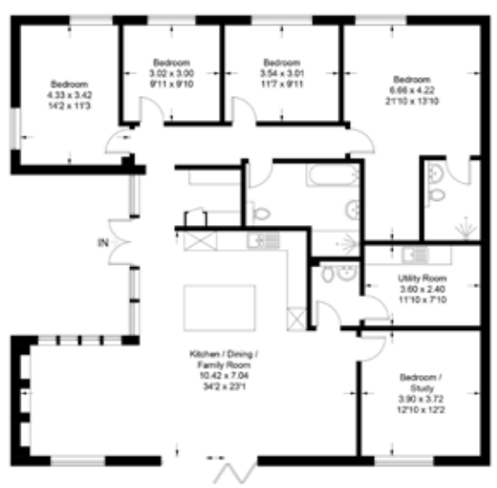
Illustration for identification purposes only, measurements are approximate, not to scale. Imageplansurveys @ 2023