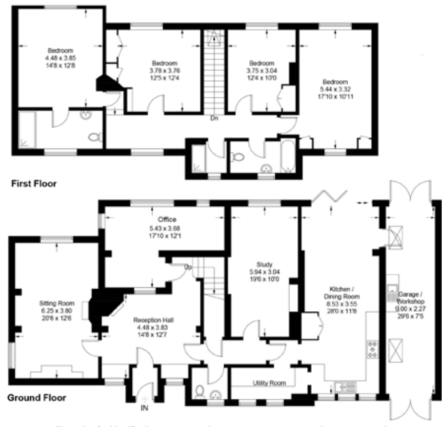
Illustration for identification purposes only, measurements are approximate, not to scale. Imageplansurveys @ 2023

Consumer protection from unfair trading regulations 2008