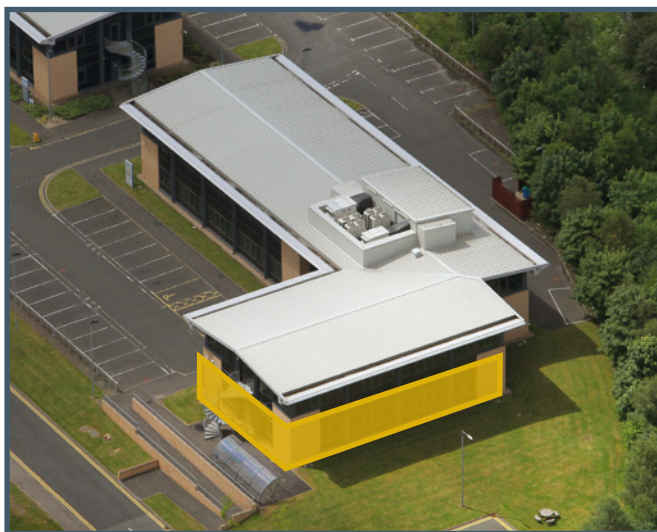
GROUND FLOOR, NORTH WING