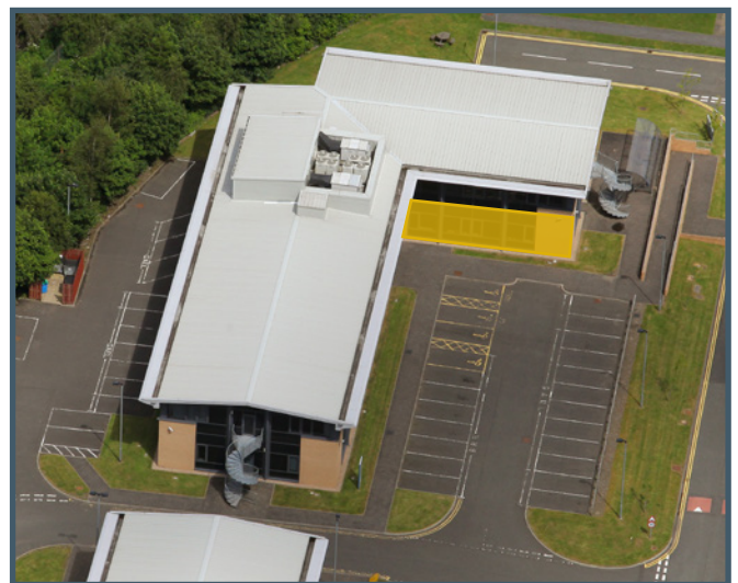
11 CAR PARKING SPACES ALLOCATED