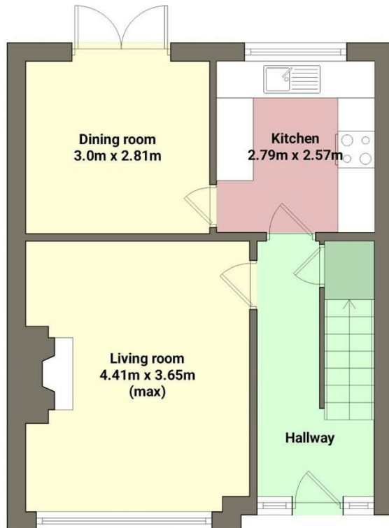
Ground floor Area: 38.95 m 2

A lovely three bedroom semi detached property situated in a sought after location. Within the catchment for excellent local schools, close to Rainhill Village, transport routes and motorway links. The accommodation briefly comprises of entrance hall, lounge with feature fireplace, dining room with french doors to the garden and fitted kitchen with built in appliances. On the first floor are three bedrooms and a modern family bathroom. The property has gardens to the front, side and rear with a driveway leading to a single detached garage. An early viewing is recommended. EPC GRADE: D